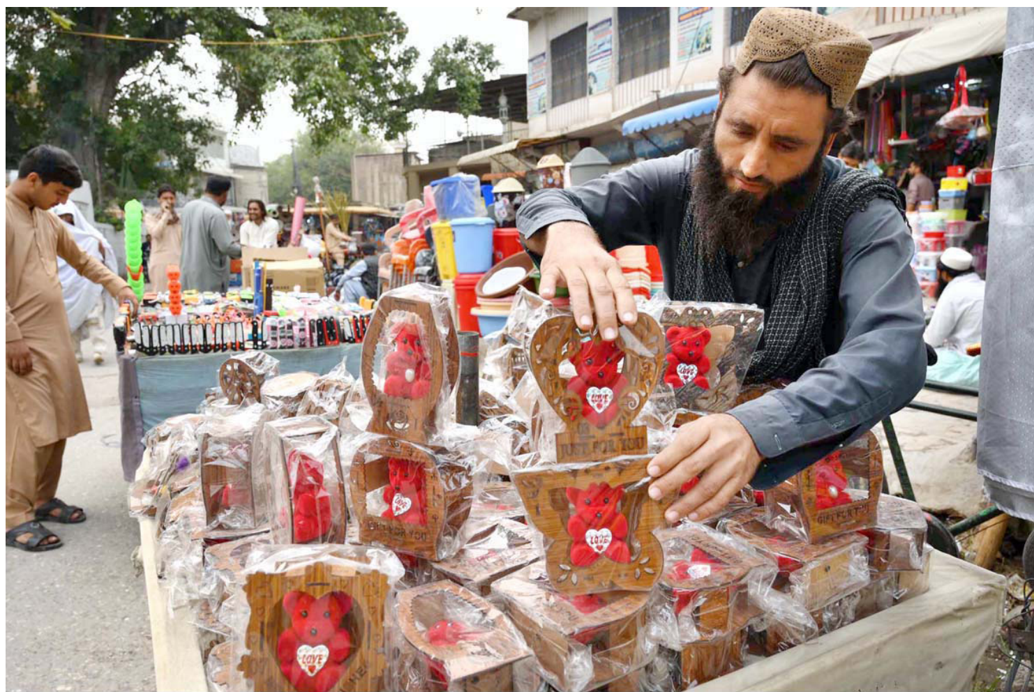
PESHAWAR: A vendor displaying beautiful decoration pieces on his handcart to attract customers near Mohallah Jhangi.