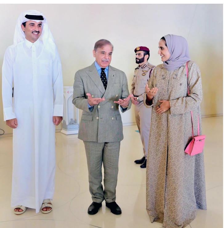
DOHA: Prime Minister Muhammad Shehbaz Sharif, Amir of Qatar, Shiekh Tamim Bin Hamad Al-Thani and his sister and Chairperson of Qatar Museums, Sheikha Al-Mayassa bint Hamad bin Khalifa al-Thani visit the gallery of Pakistani artworks titled “Manzar: Art and Architecture of Pakistan from 1940s to Today” in the National Museum of Qatar.

portance of continuing high-level exchanges to promote understanding, foster cooperation, and identify new areas for growth. The Prime Minister of Qatar showed his resolve to work with Pakistan for peace in the region including Afghanistan. Shehbaz Sharif extended an invitation to Qatari investors to explore Pakistan’s diverse economic sectors, including agriculture, Information Technology, and tourism. He outlined the Pakistani government’s commitment to providing a conducive environment for foreign investors and discussed potential incentives to facilitate their entry into the Pakistani market.