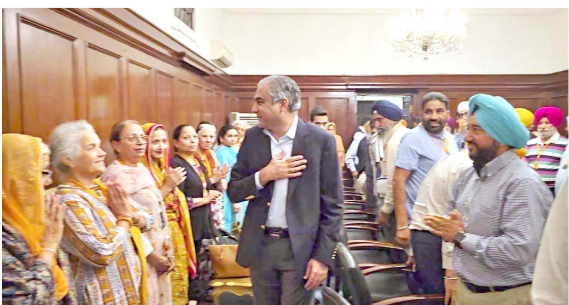
LAHORE: Interior Minister Mohsin Naqvi greeting Sikh Yaatris delegation from USA at State Guest House.