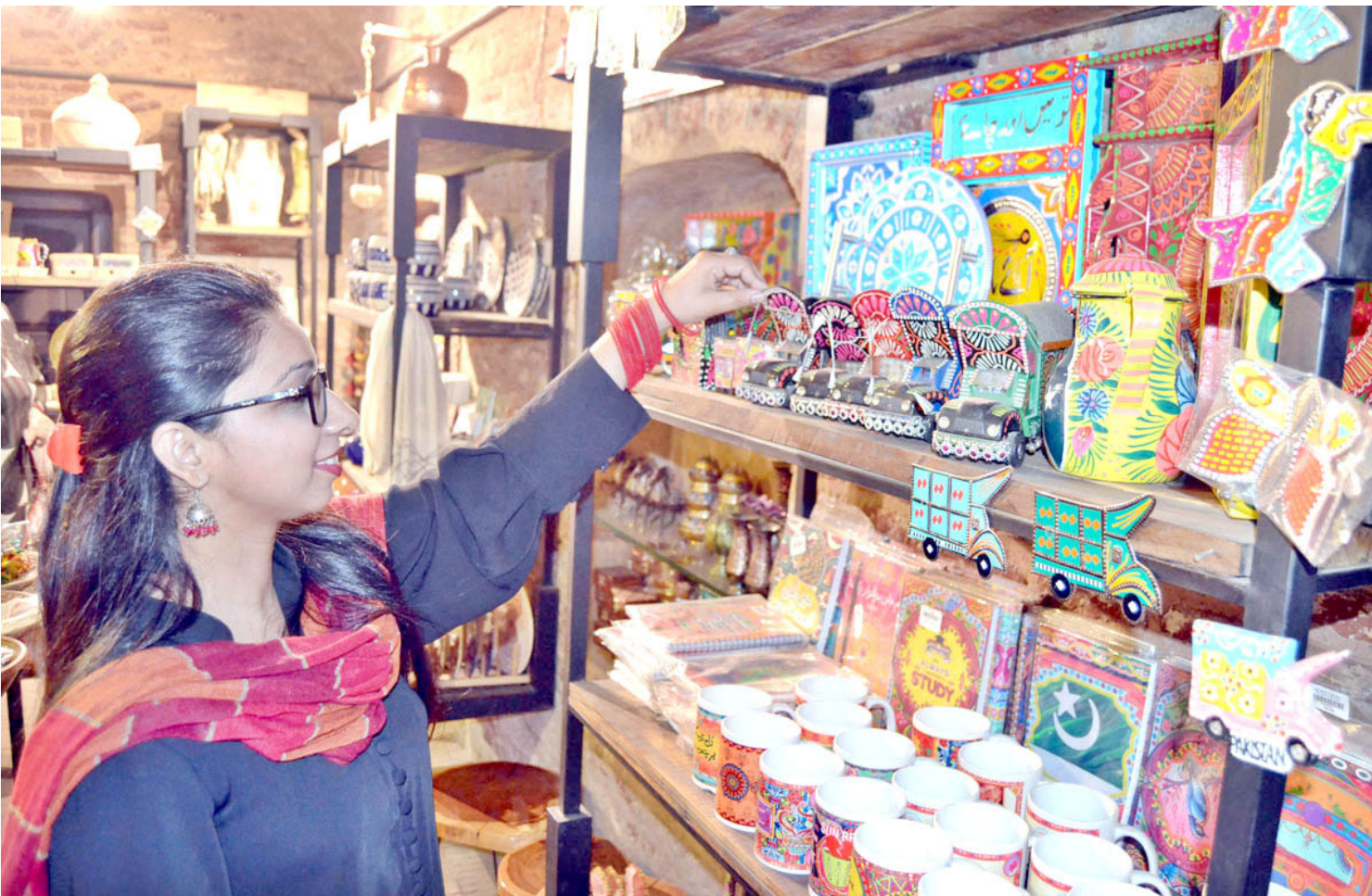
LAHORE: A Women browses and selects handcrafted decorative items especially truck art at a handicrafts shop near Delhi Gate. APP

Qaiser highlighted that Saudi Arabia is seeking skilled labor, IT professionals, and technical advisers from Pakistan and we are committed to meeting these demands. This collaboration will not only benefit the two nations but also contribute to building a prosperous and peaceful future for the region and the Islamic world, he added. APP