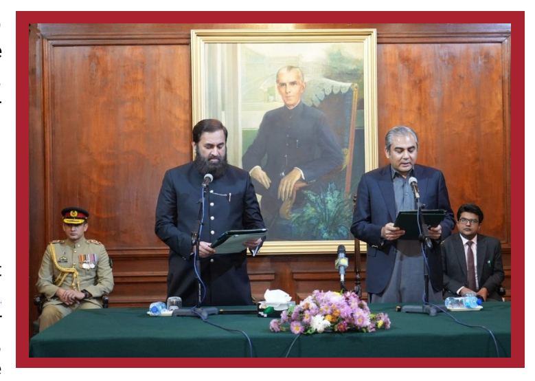
Mohsin Naqvi and Muhammad Azam Khan have been appointed as the caretaker Chief Ministers of the Punjab and KP government respectively.